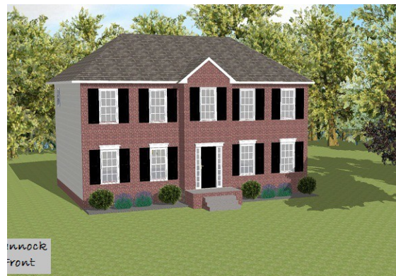
Optional Brick Front