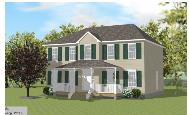
Optional Country Porch